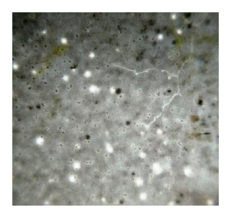
Fig 3a. sStarch and Iodine stained shell