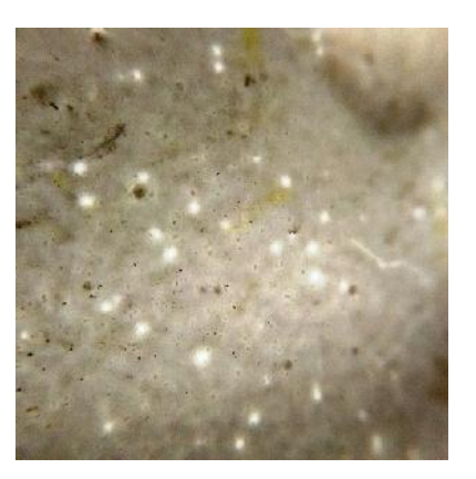
Fig 3b. Starch digested shell surface