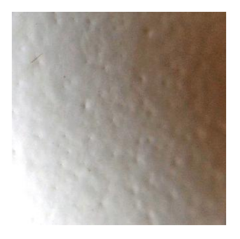
Fig 1a. Unstained egg shell

The egg shell surface has revealed the presence of positive proteins where as shell membrane had no response toninhydrin. The iodine mediated test gave an idea that surface of the shell do contain amylase. The method of photo recording had given a clear picture of shell pores. Nihydrin staining of egg shell opened way for new thinking on egg shell related studies .The egg shell seems to be a promising source of calcium of industrial utility. Organization of pores and proteins have given a new idea for analysis of egg shell topography.