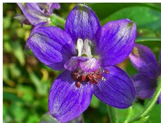
Figure I. 20

Its use in post coital cystitis has been documented 21 . Staphysagria is also useful in joint pain that usually appears due to tenderness, injured, immobile limbs. Staphysagria is also recommended by homeopaths for the treatments of Styes, teething problem, Blepharitis, Psoriasis, hemorrhoids. 22